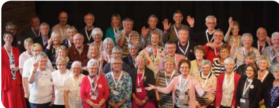
People Helping People

The day ended with a photocall on the stage for all Good Neighbours.